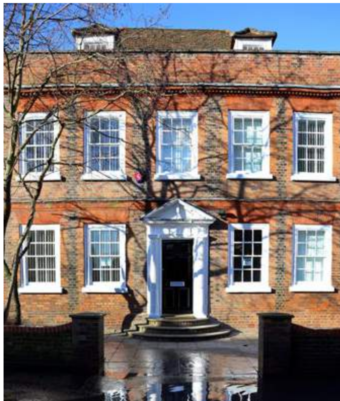
Above Front elevation of Harbour House, at 6–8 Hythe Quay